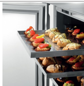
40x60 cm trays