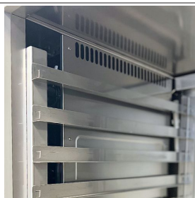
Automatic condensate water evaporation