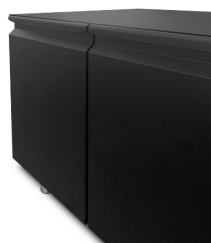
Color finish (RAL) upon request