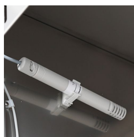
Internal room humidity control kit with electronic probe for detecting relative humidity