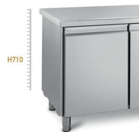
body h 710 mm