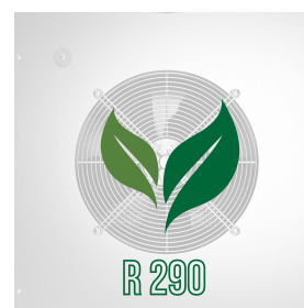
Ecological gas (R290)