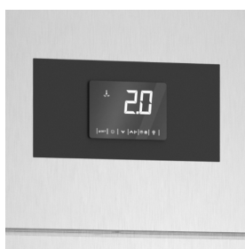
Constant temperature monitoring with digital control board